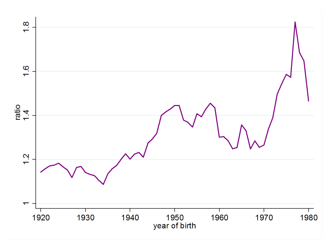
Fertility Difference between Pro-Choice and Pro-Life women