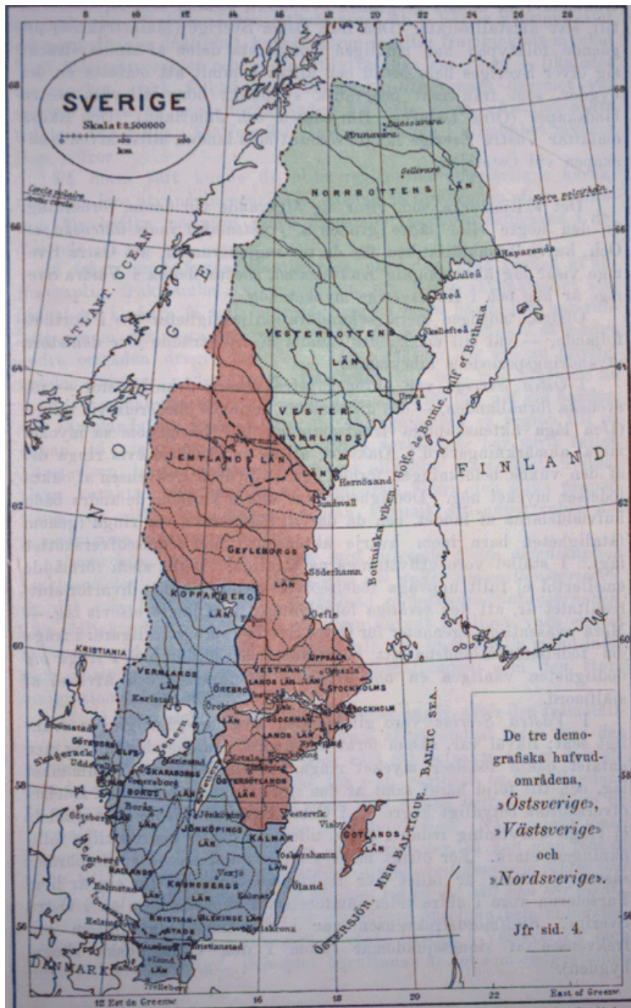
Figure 1: Gustav Sundbärg's Map of Sweden's Three Demographic Areas (1910)